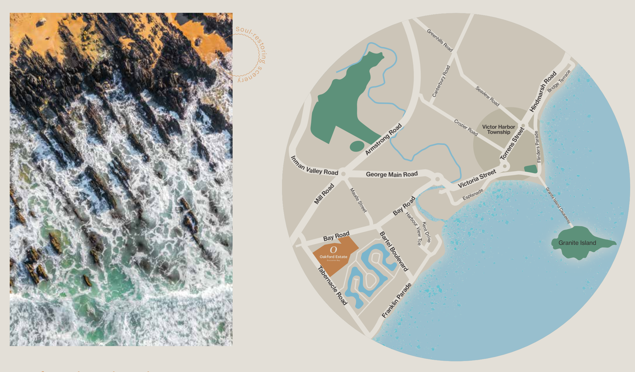
Enter from Tabernacle Road, Encounter Bay